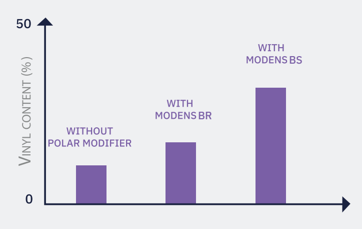
Influence of polar modifiers on vinyl content of block copolymers